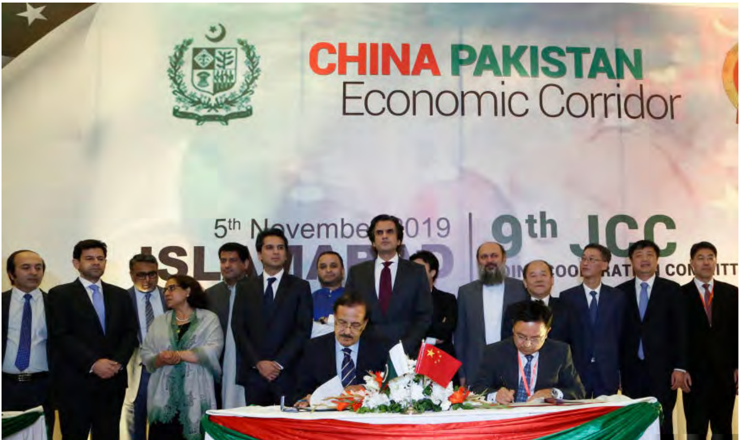
Photo above: Representatives from China and Pakistan sign cooperation documents during the ninth Joint Cooperation Committee meeting of the China-Pakistan Economic Corridor in Islamabad, Pakistan, Nov. 5, 2019.