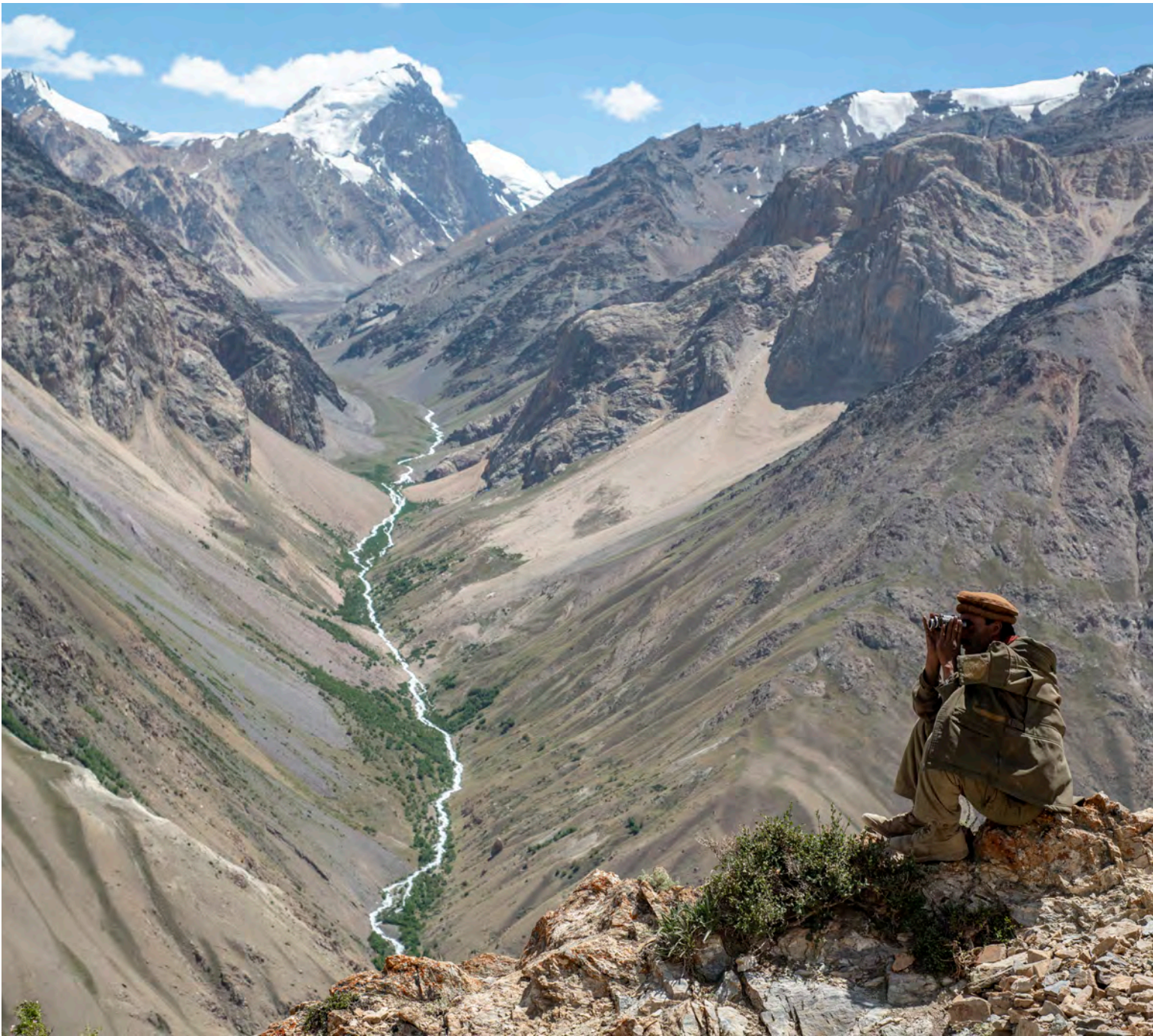
Photo above: A Wakhi man looks out to the mountains in the Wakhan Corridor of Afghanistan.

“It is clear that the continued instability in Afghanistan has the potential to destabilize Xinjiang in ways that could create impediments to the smooth implementation of the BRI.”