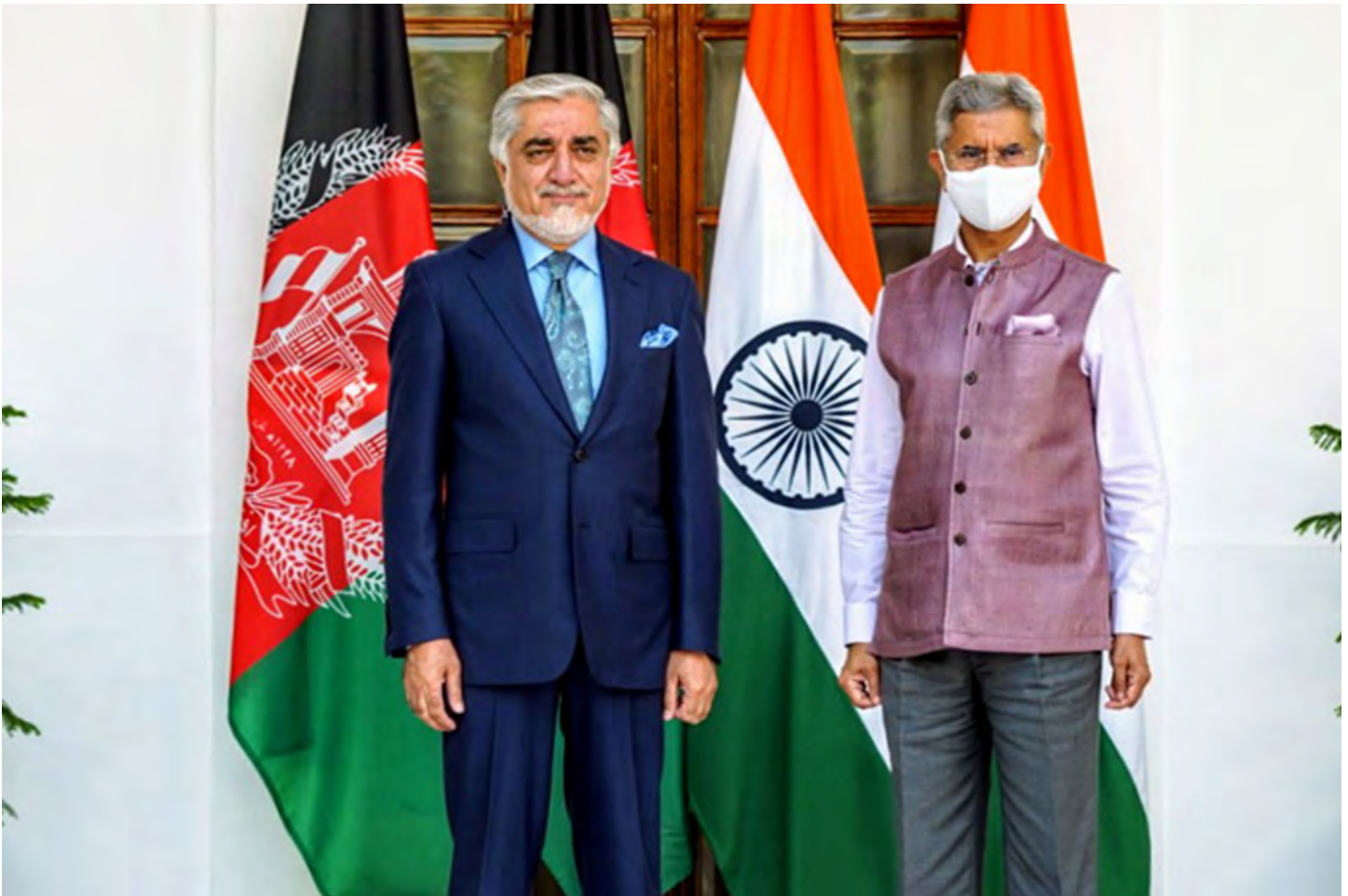
Photo above: Indian External Affairs Minister Subrahmanyam Jaishankar (R) meets Dr. Abdullah Abdullah (L), Chairman of the High Council for National Reconciliation of Afghanistan, at Hyderabad House, New Delhi, on October 09, 2020.

Shura, and Peshawar Shura — named after the Pakistani cities where they are located. There is a deep relationship with the state.” 53 Afghan National Security Adviser Hamdullah Mohib’s recent provocative comments about Pakistan, comparing it to a “brothel house,” led to the cancellation of a phone conversation planned between Prime Minister Imran Khan and President Ghani. 54 Pakistan is reported to have severed links with Mohib. And when Pakistan’s foreign minister made adverse remarks about the Indian presence in Afghanistan, Mohib condemned it strongly, tweeting that “Qureshi is either uninformed, ignorant or an accomplice” of the Taliban. 55